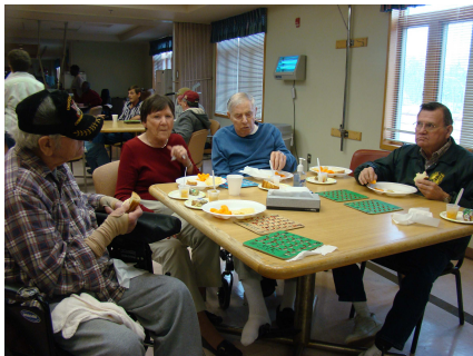
Residents enjoying the bingo and the refreshments

The 6 th District held it's annual party at the Alexandria VA Medical Center in Pineville. The residents enjoyed playing bingo and was treated to chicken salad sandwiches, chips, angel food cake, king cake, fruit cocktail and coffee. All of the residents had a wonderful time. I would like to thank Bonnette-Harrison Unit 505 from Baton Rouge – they donated $50.00 and Hunter Fabre Unit 248 from New Roads – they donated $25.00, with this money we purchased all of the food that the residents enjoyed. Thanks Unit 505 and 248.